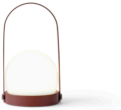
Burned Red 4863349