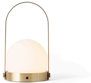
Brushed Brass 4863539